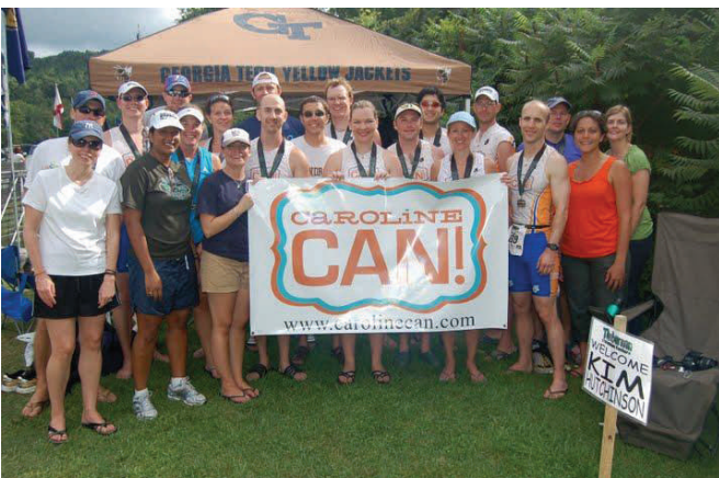
The Caroline Can! Timberman Half-Ironman racing team after completing the race.

For more information about the campaign and past fundraising events, visit www.carolinecan.com .